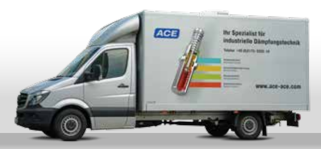
ACE demonstration vehicle - your free trainings on premises. We will give you a demonstration on your parking place, you supply a 230V power connection.